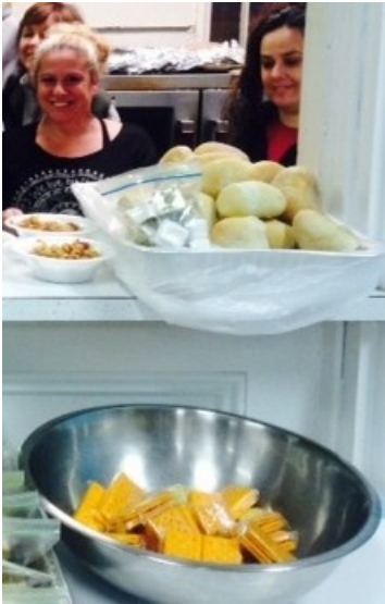
Pilgrim Shelter Volunteers

New Bedford has a few nicknames and among them is Secret City. There has always been a wealth of talented people that come from this city, and not as well known as they should be. Did you know that Pete Souza born in New Bedford and a graduate of Dartmouth High is the official White House photographer for President Barrack Obama and President Reagan? He is referred to as the most powerful unknown person in Washington.