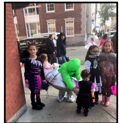
Downtown New Bedford