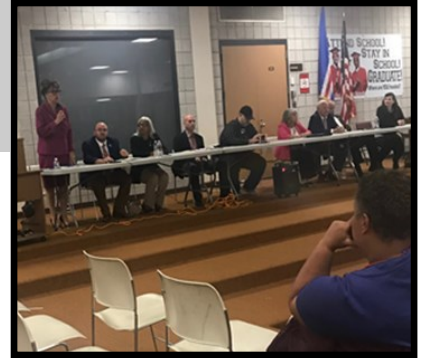
Debate Night at Gomes School.