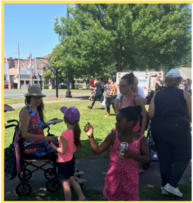
Above Left: Photo from National Night Out 2019.