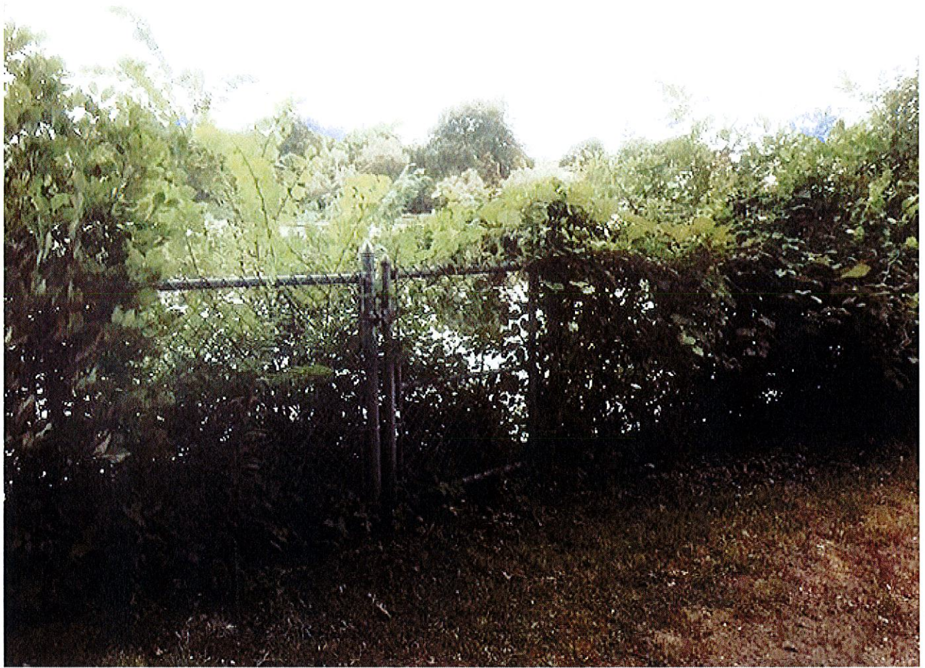
Gate at dam