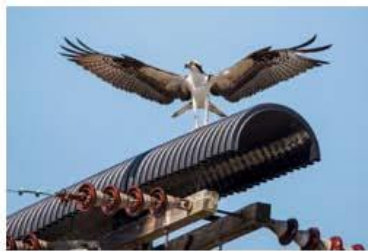
Figure 1. Photo from Falmouth Enterprise ( https://www.capenews.net/falmouth/news/wildlife-enthusiasts-eversource-continue-to-wrangle-over-osprey-nesting/article_011d576a-0f2b-5468-a00a-0e9fdd8042af.html ) showing corrugated HDPE installed on utility pole to deter osprey nesting.