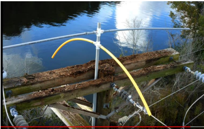
Figure 3. Photo of “Off-Sprey Raptor Deterrent” ( https://offsprey.com/osprey-deterrents-what-deters-and-what-doesnt/ ) showing compliant crossed PVC tubing mounted atop a utility pole to prevent osprey nesting.

A final option is a simpler version of the above measures, consisting of crossed concave downward PVC tubing, again to prevent birds from placing sticks on any flat surfaces of the structures, and presenting an obstruction to clear landing on the structure (Figure 3). The cross structure of the PVC makes it difficult for large birds to land on the structure since the PVC obstructs their clear access to the more solid structure. Meanwhile the compliant nature of the PVC makes it unsuitable to land on, since the weight of the birds causes it to deflect significantly, and hence not provide a solid perch.