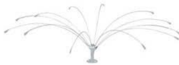
Figure 2. Photo of 2 ft diameter "Bird-B-Gone" ( https://www.birdbgone.com/bird-spider-360 ) showing base and stainless flexible blunt-ended wires to deter birds from landing.