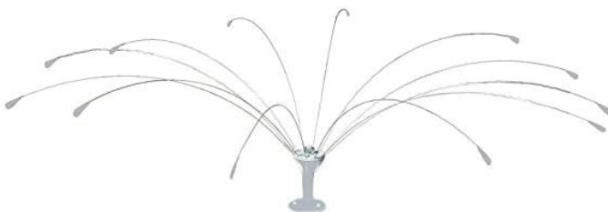
Figure 2. Photo of 2 ft diameter “Bird-B-Gone” ( https://www.birdbgone.com/bird-spider-360 ) showing base and stainless flexible blunt-ended wires to deter birds from landing.

A second option to deter birds from landing and/or nesting on the tower is to install a “spider” on the top of the structure (Figure 2). As osprey and other raptors are typically rather large birds, they require significant clearance to land and take to flight. The “spider” deters them from landing by making it difficult for them to get a clear footing on the structure without interference from the “legs” of the spider. As with the above corrugated HDPE pipe solution, the bird “spider” does not harm birds, but serves as a deterrent to them landing on a structure.