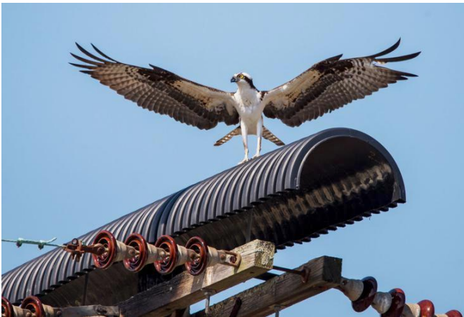
Figure 1. Photo from Falmouth Enterprise ( https://www.capenews.net/falmouth/news/wildlife-enthusiasts-eversource-continue-to-wrangle-over-osprey-nesting/article_011d576a-0f2b-5468-a00a-0e9fdd8042af.html ) showing corrugated HDPE installed on utility pole to deter osprey nesting.

Approaches to minimizing nesting of migratory sea birds, particularly osprey, generally focus on preventing osprey from building nests on top of towers. The preferred deterrence measure is to eliminate where possible any flat surfaces where birds can lay sticks to build a nest. For the proposed towers, the top of the towers will present a triangular structure approximately 24” on each side of the triangle. One option to deter nest building would be to install a short section of semi-circular corrugated HDPE culvert pipe atop the tower structure to create a downward-facing concave surface on the top of the tower, such that any sticks placed on the structure in an effort to build a nest will immediately fall off. An example of such corrugated HDPE pipe installed on a utility pole is shown below (Figure 1). For the current tower design, a roughly 24” length of 18” diameter corrugated pipe (cut lengthwise) would be sufficient to cover the top of the tower and while presenting minimal additional windage to the tower (~1.5 sq ft).