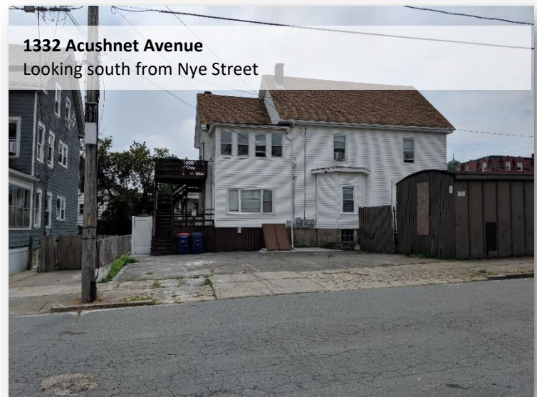
1332 Acushnet Avenue Looking south from Nye Street