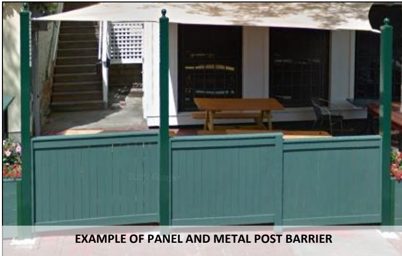
EXAMPLE OF PANEL AND METAL POST BARRIER