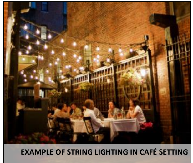
EXAMPLE OF STRING LIGHTING IN CAFÉ SETTING