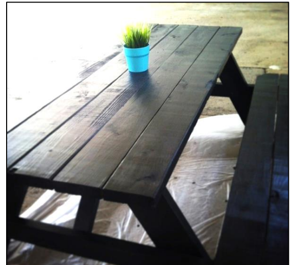
EXAMPLE OF A STAINED PICNIC TABLE

Staff recommends the approval of the application and the issuance of a Certificate of Appropriateness with the conditions so noted. Sidewalk Café Seating requires permitting through the Planning and Licensing Boards and any modification arising from future City Board review and action shall be evaluated by Staff to determine whether a modification of the Certificate of Appropriateness is necessitated.