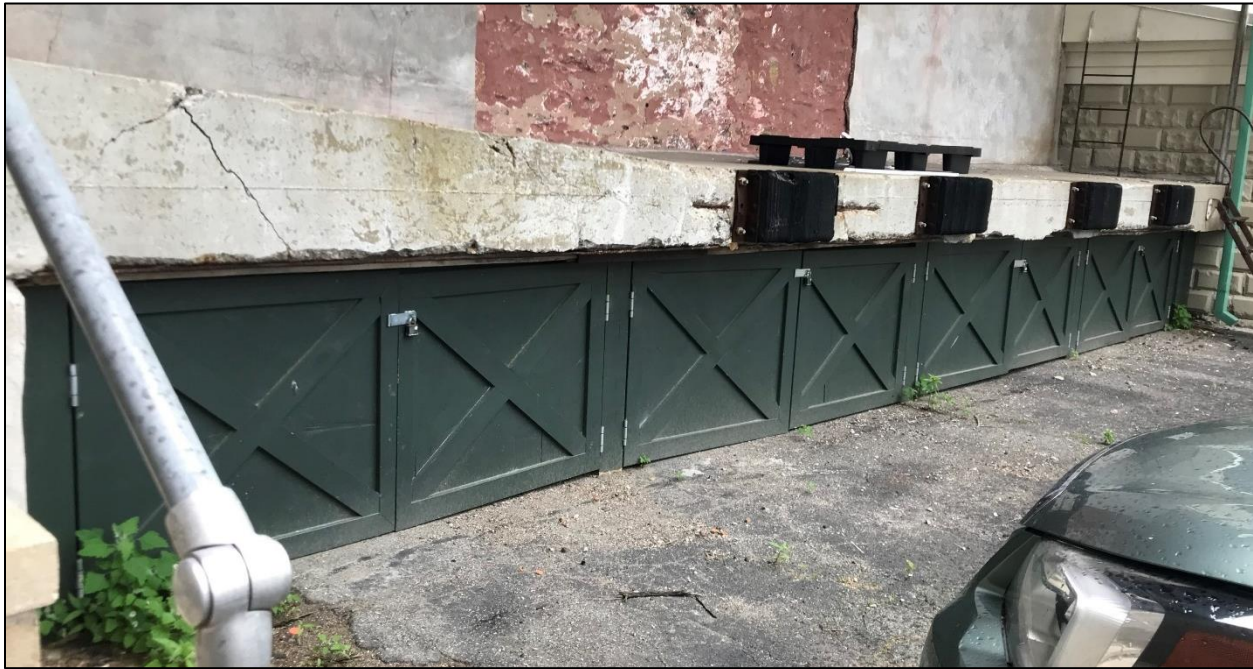
EXISTING CONDITIONS- CENTRE STREET LOADING DOCK

STAFF RECOMMENDATION: The previously installed enclosure under the Centre Street loading dock consists of four (4) barn-type double wooden doors painted dark green to match the building's existing trim. The area under the dock was an attractive nuisance and the enclosure prohibits trespassing as well as trash accumulating. Staff recommends approval and the issuance of a Certificate of Appropriateness for the loading dock enclosure.