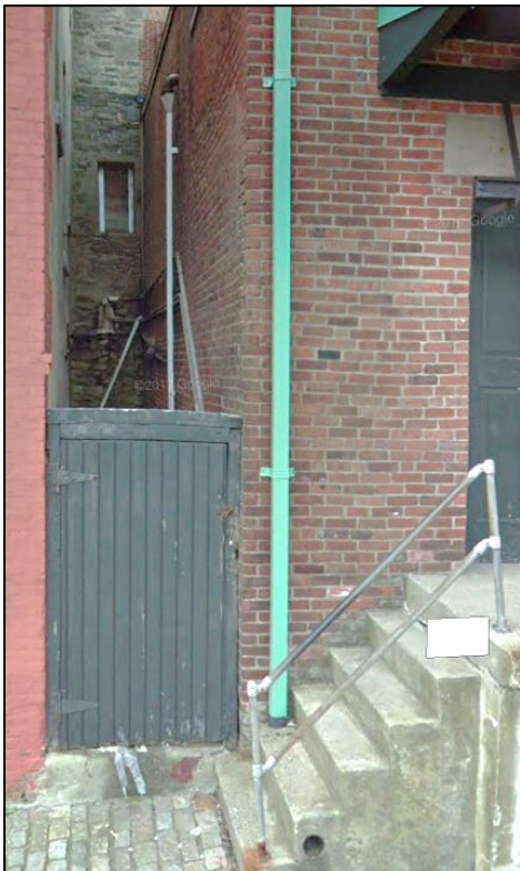
Previous Hamilton St. Gate