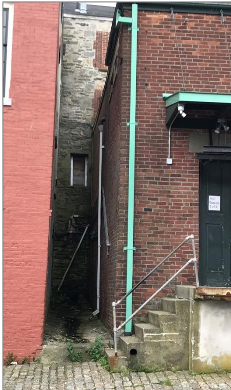
Existing Hamilton St. Conditions