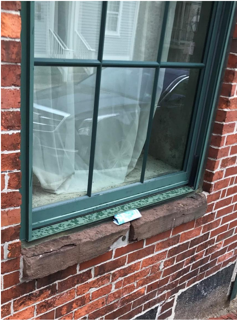
Existing Conditions- Centre Street Window