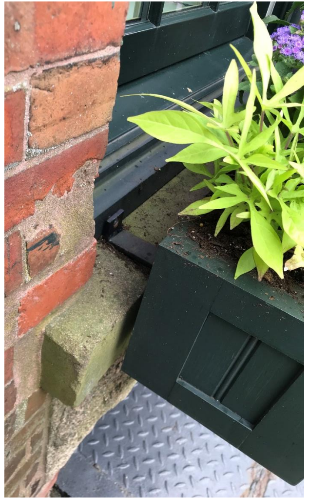
26 Centre Street Window Box Installation Method

The proposed gate to be located on Hamilton Street will replace a previous gate lost to a storm. The replacement gate is proposed to be painted wood and will match an existing gate located at the Centre Street alley way. Staff recommends approval and the issuance of a Certificate of Appropriateness for the gate.