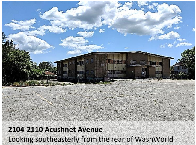
2104-2110 Acushnet Avenue Looking southeasterly from the rear of WashWorld

Pavement markings shown on plans indicate directional arrows throughout the site. Bi-directional access will be available through the eastern 20 space parking lot. One-way traffic patterns are proposed on the south, north, and east sides of the commercial building. All vehicles exiting via the Belleville Avenue exit from the western portion of the site will need to travel clockwise around the building to exit; or utilize the exits via easements across the other properties to Harwich Street or Acushnet Avenue.