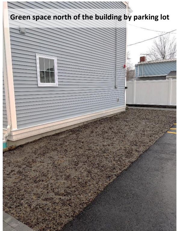
Green space north of the building by parking lot