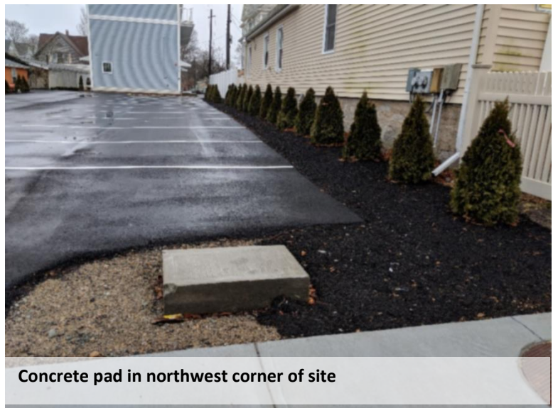
Concrete pad in northwest corner of site

The plan submission is shown as “Site As-Built Plan 475 Union Street New Bedford, Massachusetts”, dated January 16, 2019; date stamped received by City Clerks’ Office March 13, 2019. Plans were prepared SITEC, Inc., in Dartmouth, MA. Stamped by Steven D. Gioiosa, PE.