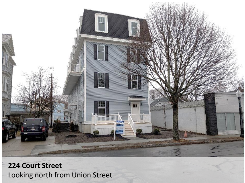
224 Court Street Looking north from Union Street

Request by applicant for Modification of Site Plan approval of previously approved Cases #38-14 & # 27-17 which were for the construction of a multi-unit residential building (6 – Two (2) Bedroom Units) at 224 A-B Court Street (Map: 51 Lot 269) f/k/a 475 Union Street (Map:51 Lot: 269) located in a Mixed-Use Business (MUB) and Residence B (RB) zoned districts.