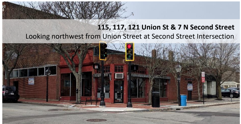
115, 117, 121 Union St & 7 N Second Street Looking northwest from Union Street at Second Street Intersection