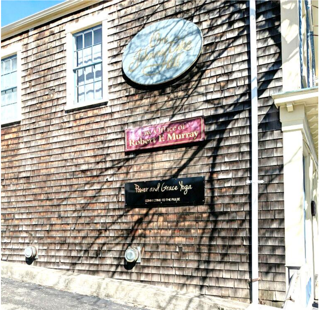
EXISTING CONDITIONS- WEST FACADE

The proposed signage is appropriate in design and scale for the building and Staff recommends the approval and the issuance of a Certificate of Appropriateness.