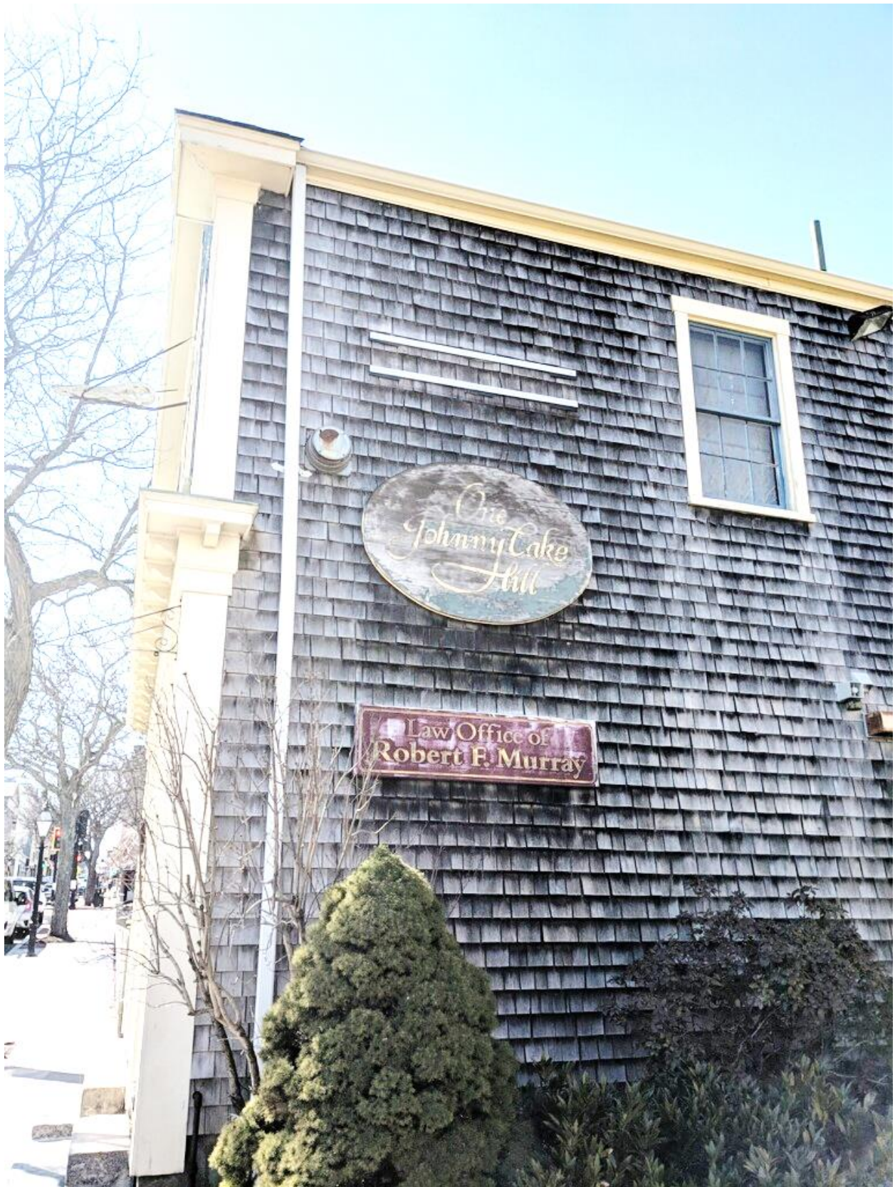
EXISTING CONDITIONS- EAST FACADE