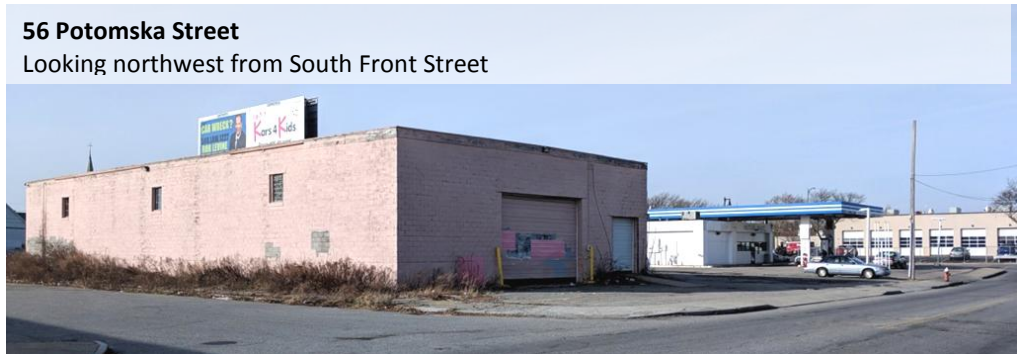
56 Potomska Street Looking northwest from South Front Street

On the southern parcel is a warehouse building.