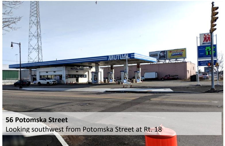
56 Potomska Street Looking southwest from Potomska Street at Rt. 18

The northernmost parcel currently has a convenience store and gas station, known as Mutual Mart. The store and fueling stations are all under a single canopy. There are four pump islands on the east side of the store and two pump islands on the west side of the store; for a total of fourteen fueling pumps. A pylon ground sign is located in the northwest corner of the site.