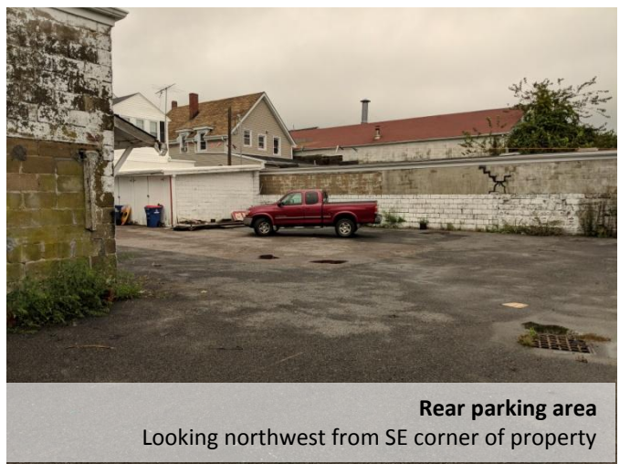
Rear parking area Looking northwest from SE corner of property