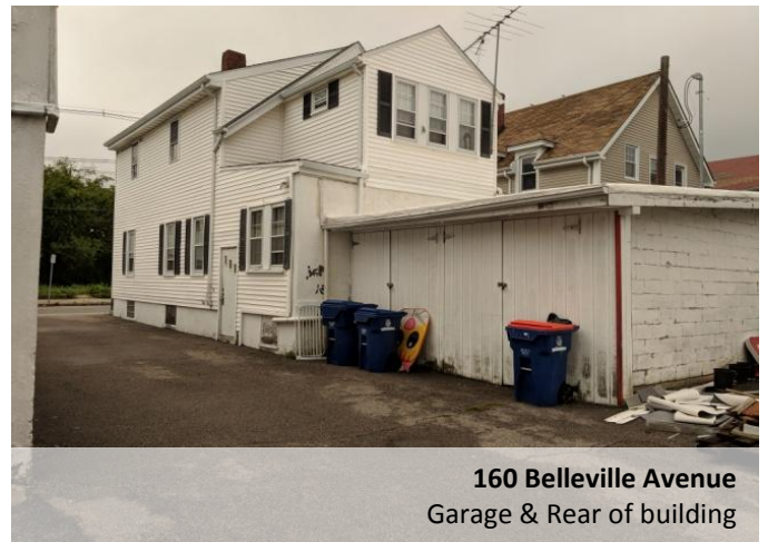
160 Belleville Avenue Garage & Rear of building