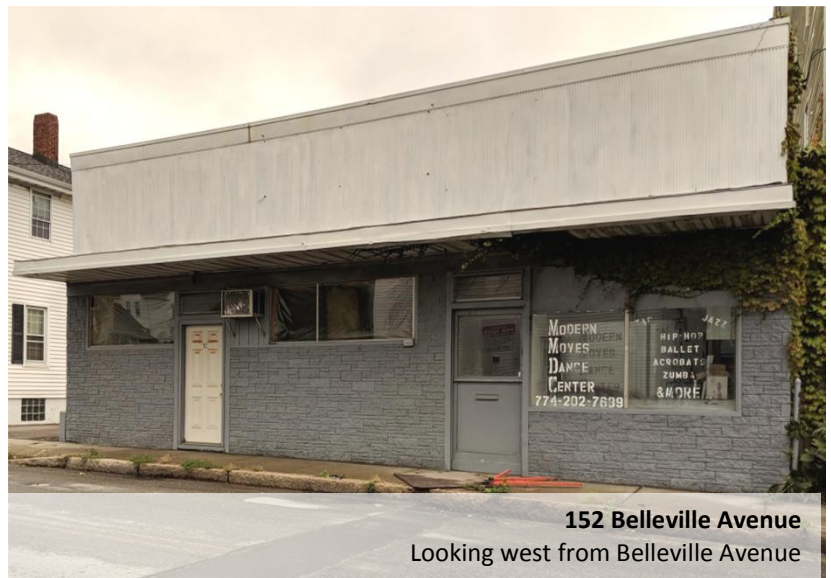
152 Belleville Avenue Looking west from Belleville Avenue

Applicant's Agent: SITEC, Inc. 449 Faunce Corner Road Dartmouth, MA 02747