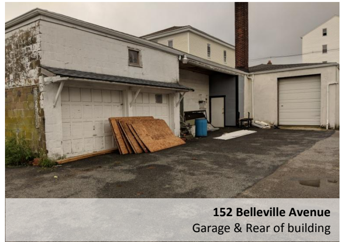
152 Belleville Avenue Garage & Rear of building