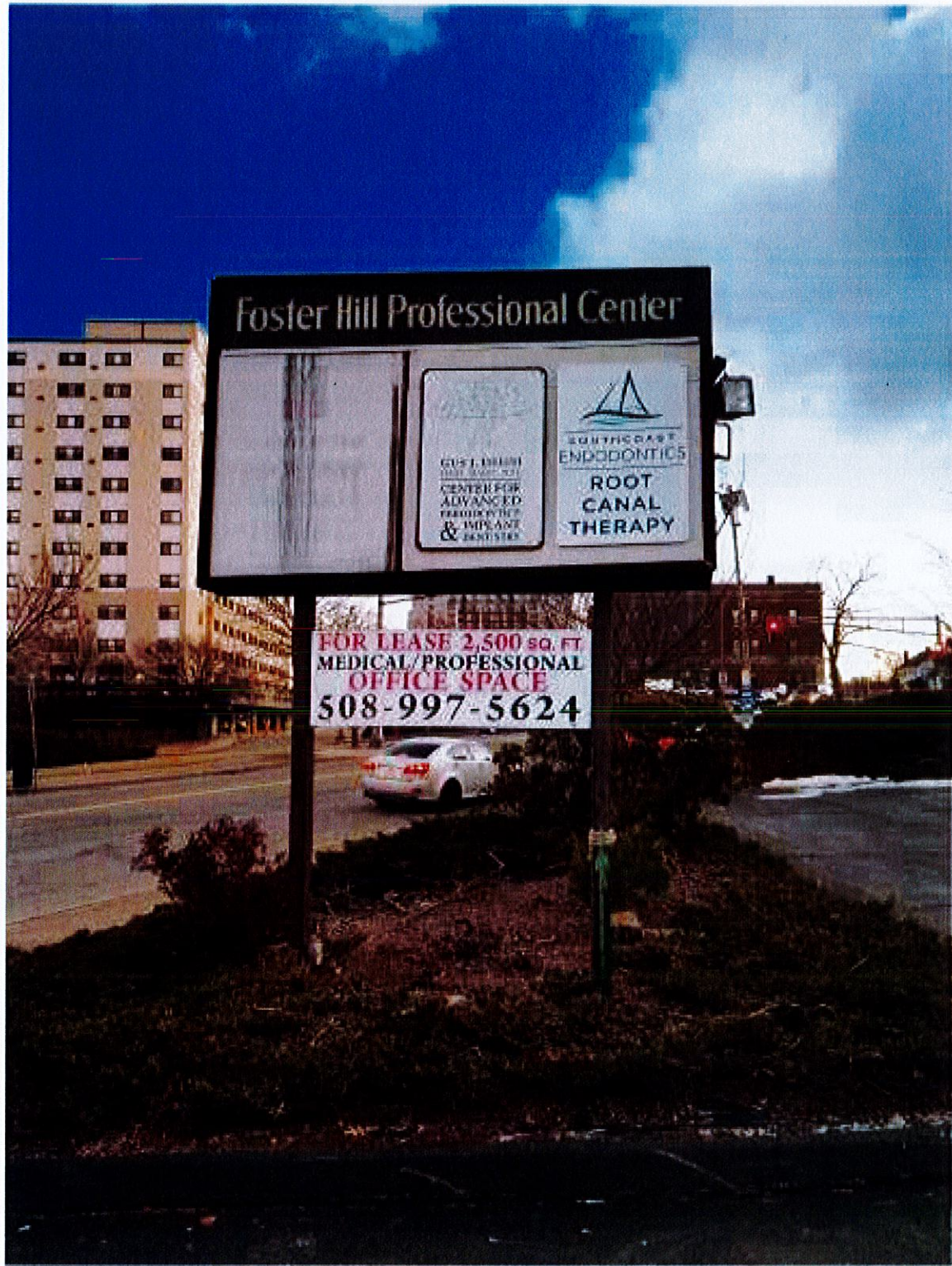
A Photo Comp - Existing Not to Scale