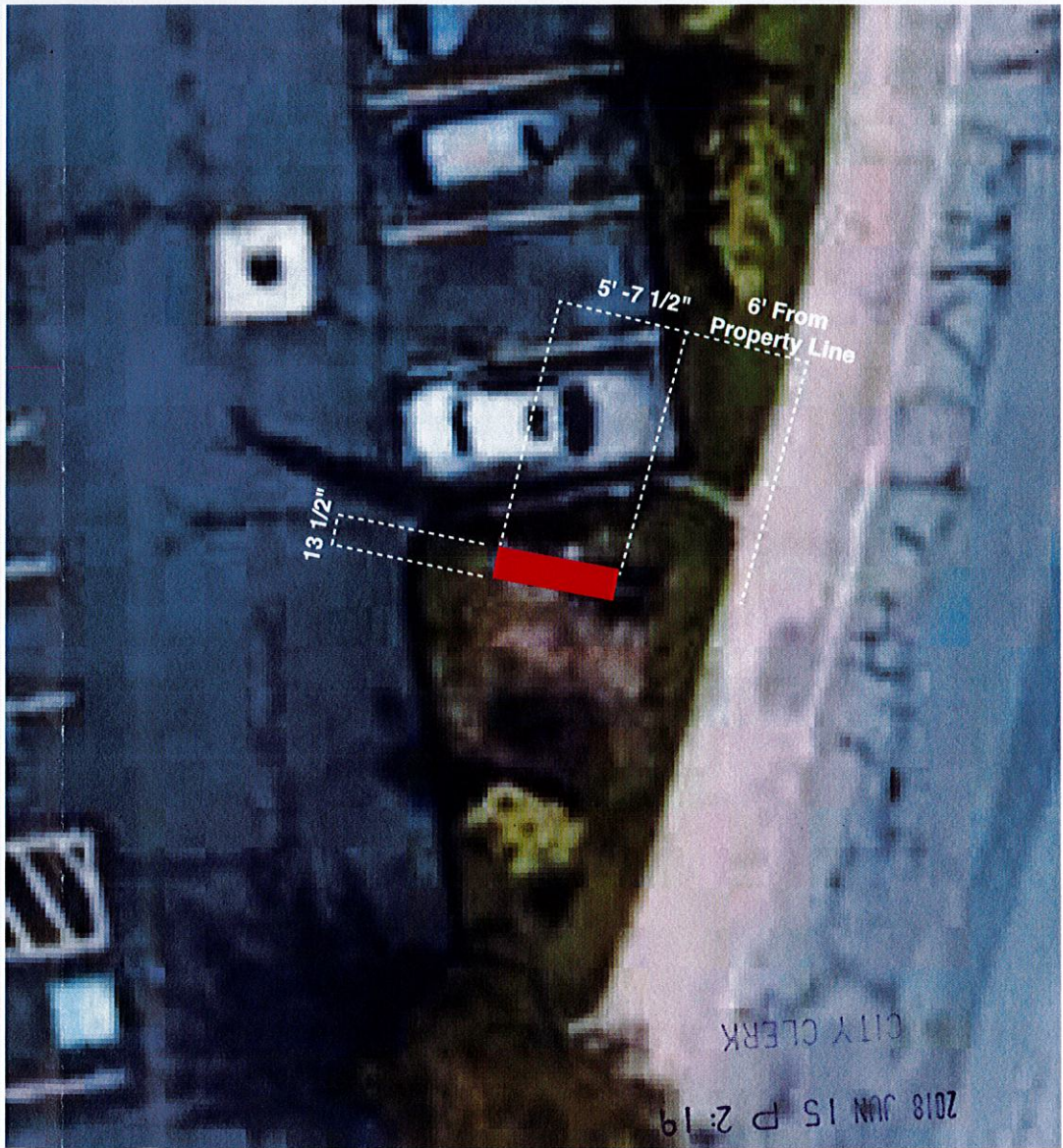
A Site Plan Not to Scale