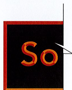
(C) Detail - Carved Letter Sample - Front View Scale: 1 1/2"=1'-0"