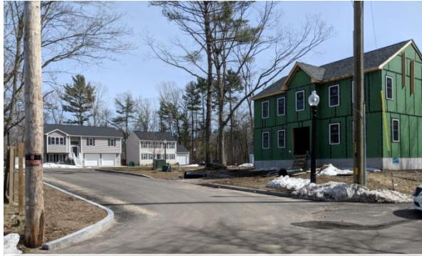
Cardinal Place Looking east from Swallow Street