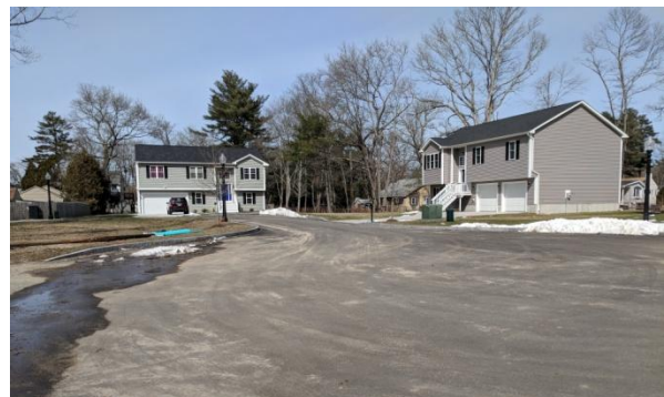
Cardinal Place Looking north on Ava's Way