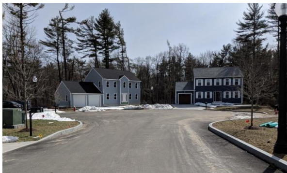
Cardinal Place Looking south on Ava's Way