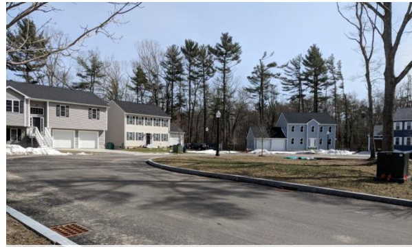
Cardinal Place Looking southeast from Cardinal Street