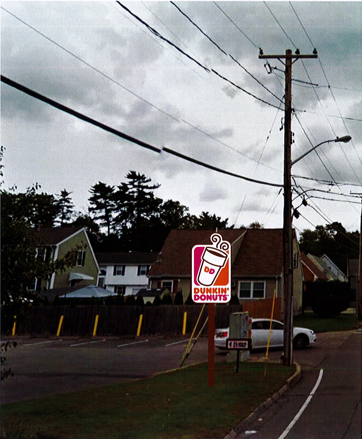
A Photo Comp - Proposed