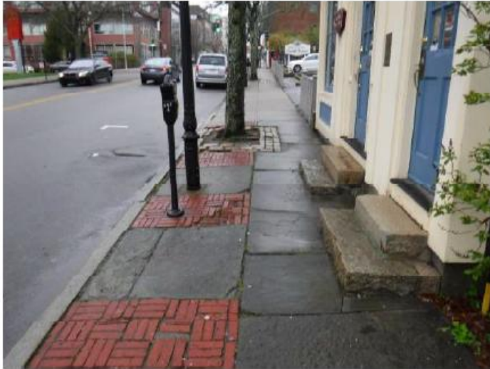
Union Street - transition from stone to concrete walk