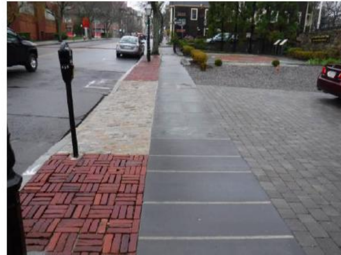
Union Street – looking west towards Paul Cuffe Park & Johnny Cake Hill