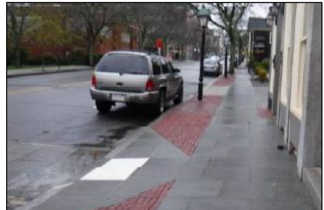
Typical Sidewalk: Northwest Corner of N Water & Union Street

APPLICANT'S AGENT: Lisa Sherman, PE CDM Smith, Inc. 260 West Exchange Street, Suite 300 Providence, RI 02903