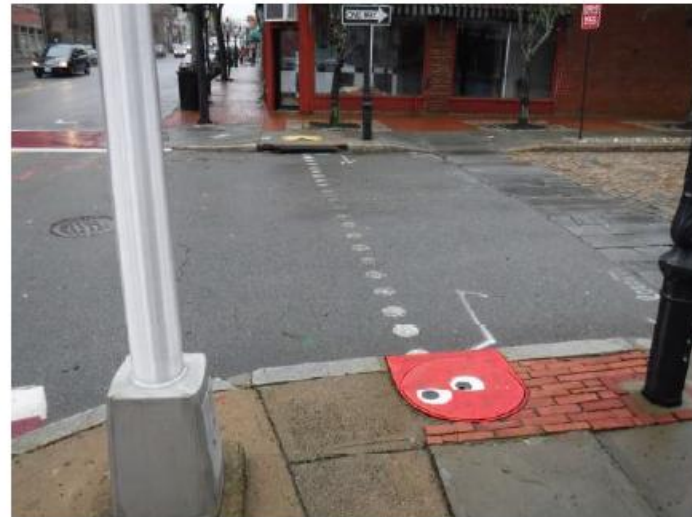
Union Street - looking west across North Second Street