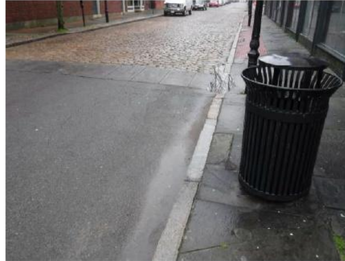
Acushnet Avenue - looking north from Union Street