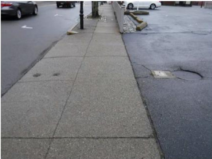
Union Street - looking west at concrete sidewalk outside St. Anne Credit Union