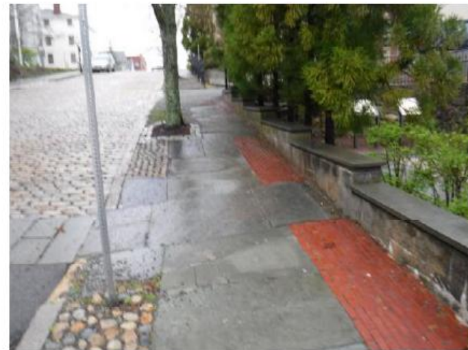
Union Street – bluestone ramp looking north up Johnny Cake Hill from Union Street