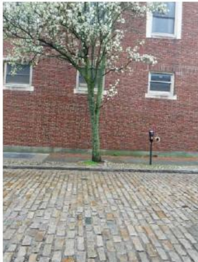
Acushnet Avenue - looking west at transition from concrete to bluestone sidewalk