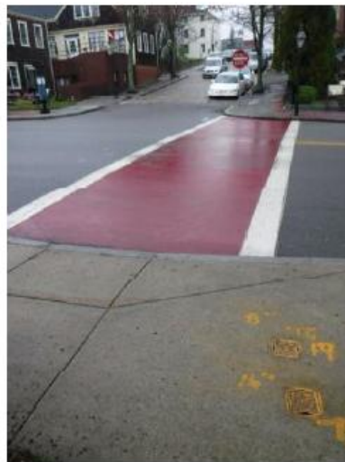
Union Street – looking north up Johnny Cake Hill