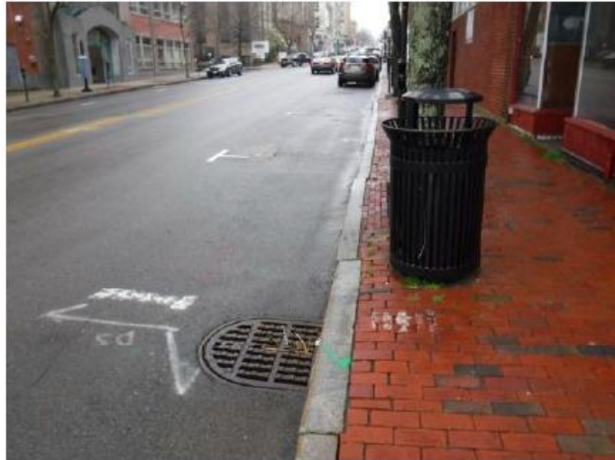
Union Street - looking west from North Second Street