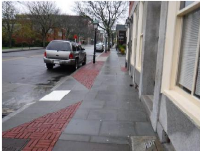
Union Street – northwest corner of Water Street looking west