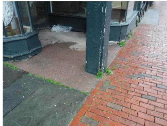
Union Street - looking at northwest corner at Acushnet Avenue at transition from brick to bluestone