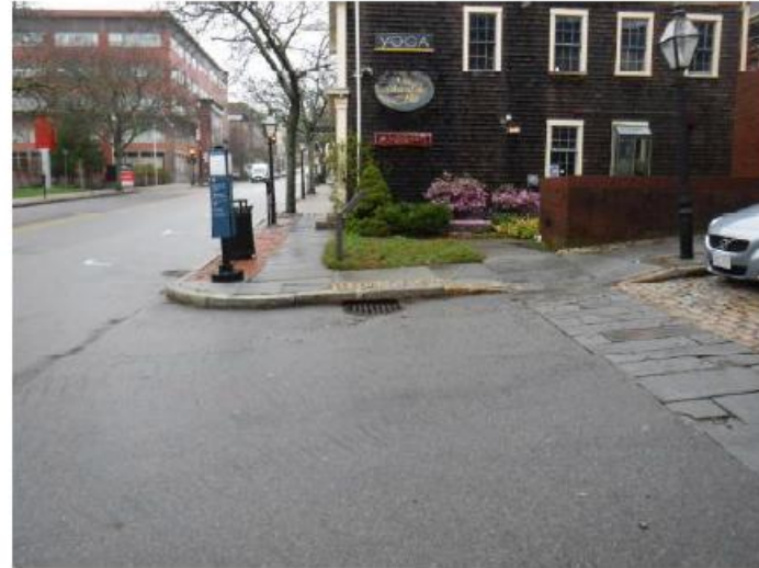
Union Street - looking west from Johnny Cake Hill