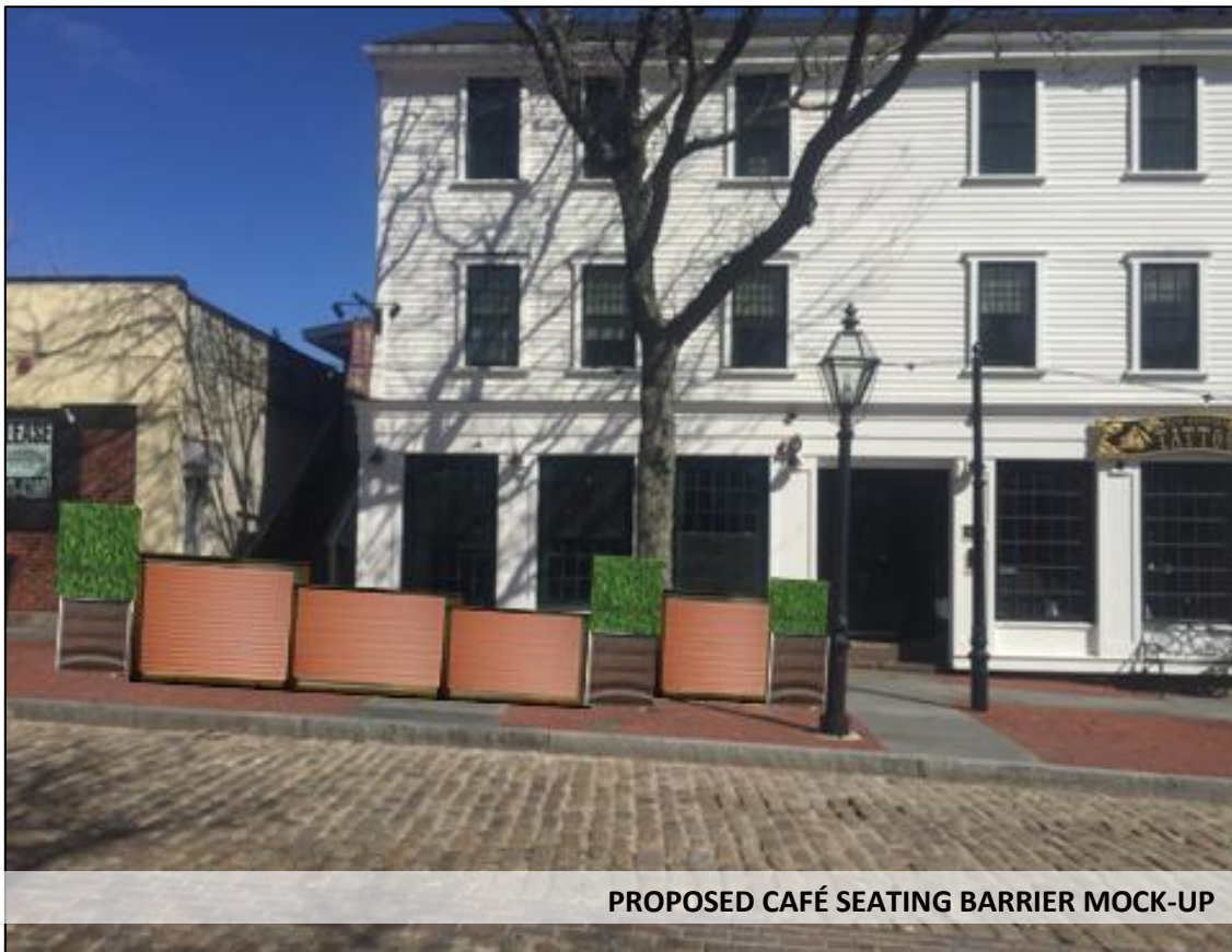
PROPOSED CAFÉ SEATING BARRIER MOCK-UP