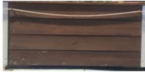
Wood & Metal Planters (from Cork)