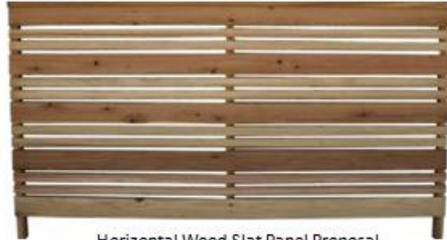
Horizontal Wood Slat Panel Proposal