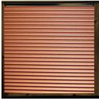
Corrugated Panel Proposal