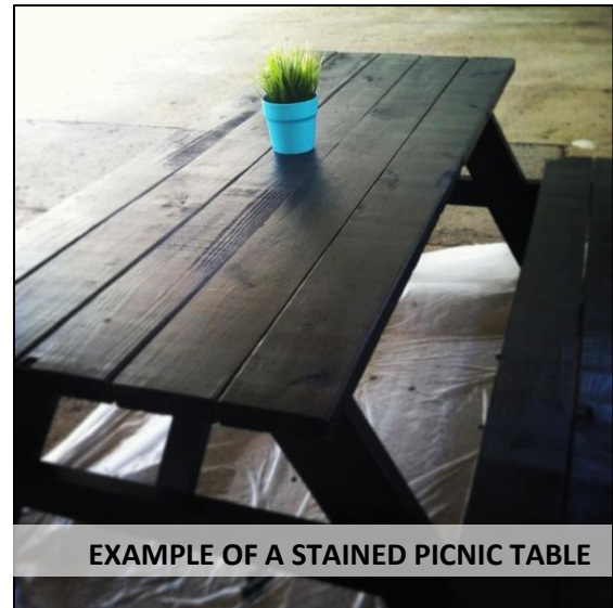
EXAMPLE OF A STAINED PICNIC TABLE

TABLES: The grade change in front of the Cultivator Shoals measures approximately 18"; making difficult the use of standard table bases and chairs. Although the use of a picnic-style table is not typical within the District, the presence of an incline presents a hardship that necessitates this type of table. Because of this, and given that the tables would not be highly visible to anyone driving by the site as they would be located behind solid barriers, staff recommends approval of this style table in this location provided a dark stain is used (to achieve the look depicted in the noted illustration).