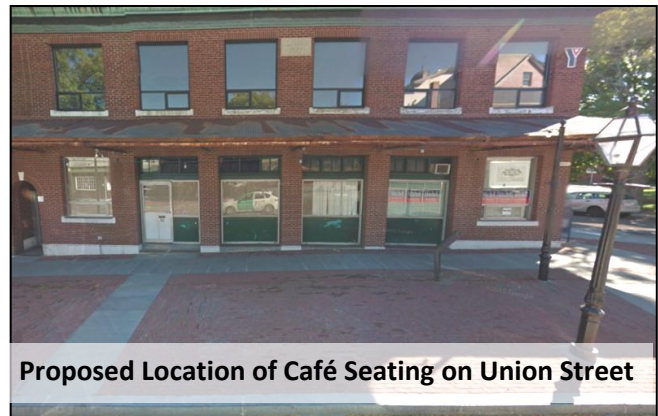
Proposed Location of Café Seating on Union Street

Owner: Marder Management Corp. 22 So Water St New Bedford, MA 02740