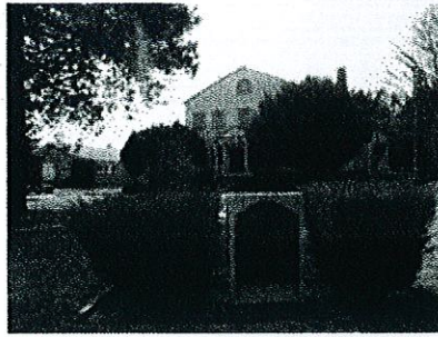
Current location of the plaque