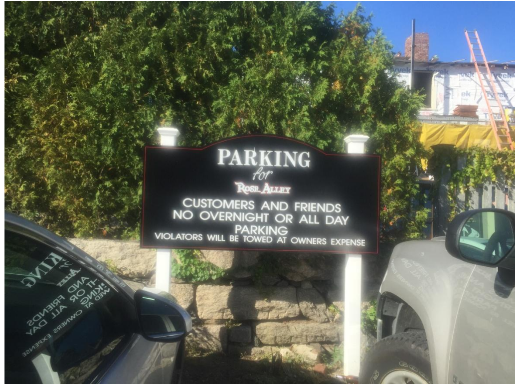
4" square PVC Post -60" H Sign-6'X 3'