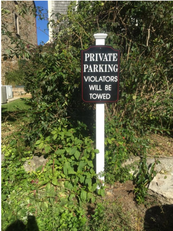
4" square PVC Post -60" H Sign-18" X 26"