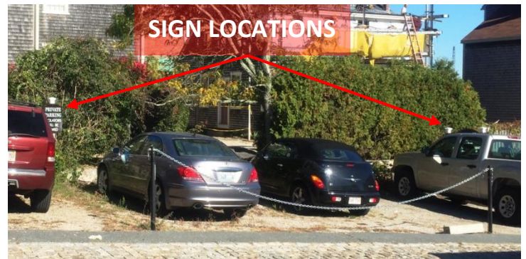
Rose Alley Parking Area