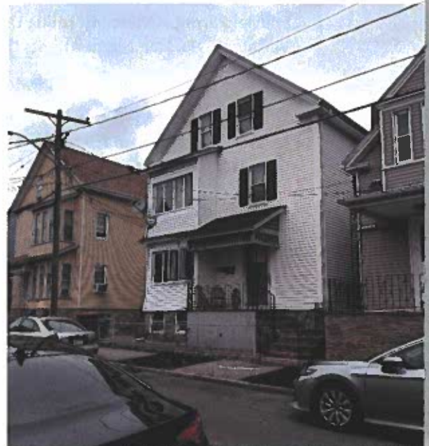
183 Washington Street

The 183 Washington Street property, like other houses in the neighborhood, are primarily 2 family 2 story houses with some backyard green space. However, this property also includes a third-floor attic residential unit. Washington Street and the surrounding neighborhood just south and east of Dartmouth Street is a residential area with low traffic. The Dartmouth Street corridor begins at the intersection with Allen Street and extends to South Dartmouth. It is primarily zoned Mixed Use Business along both sides of the street (usually a lot or two deep) and is surrounded by Residential A, B,