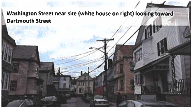
Washington Street near site (white house on right) looking toward Dartmouth Street

The some of the additional uses that would be allowed under the MUB district would not be compatible with a dense residential neighborhood.