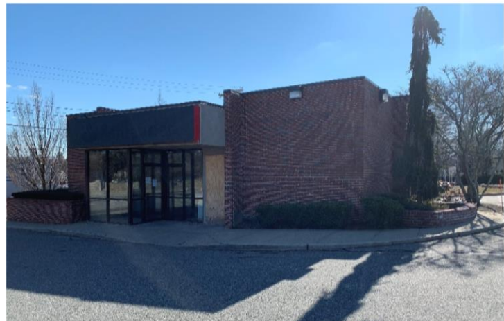
1238 Kempton Street Looking southeast from Kempton Street