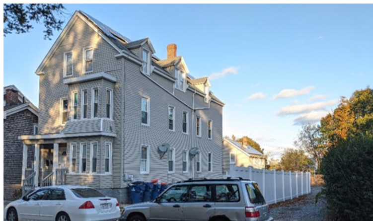
130 Summer Street Looking northeast from Summer St.

Applicant: Kevin Welch 283 Sawyer Street Unit 1E New Bedford, MA 02746