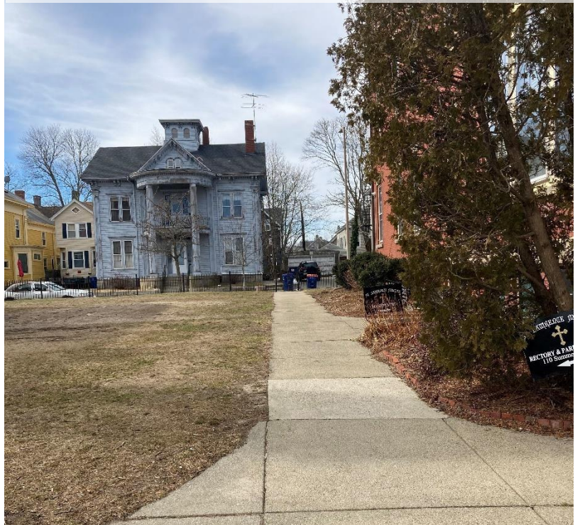
Proposed site of parking area and handicapped access lift. Looking south from concrete walkway adjacent to rectory.