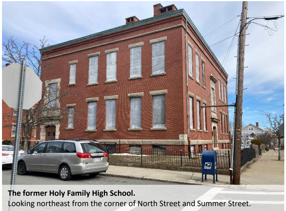
The former Holy Family High School.

Looking northeast from the corner of North Street and Summer Street.